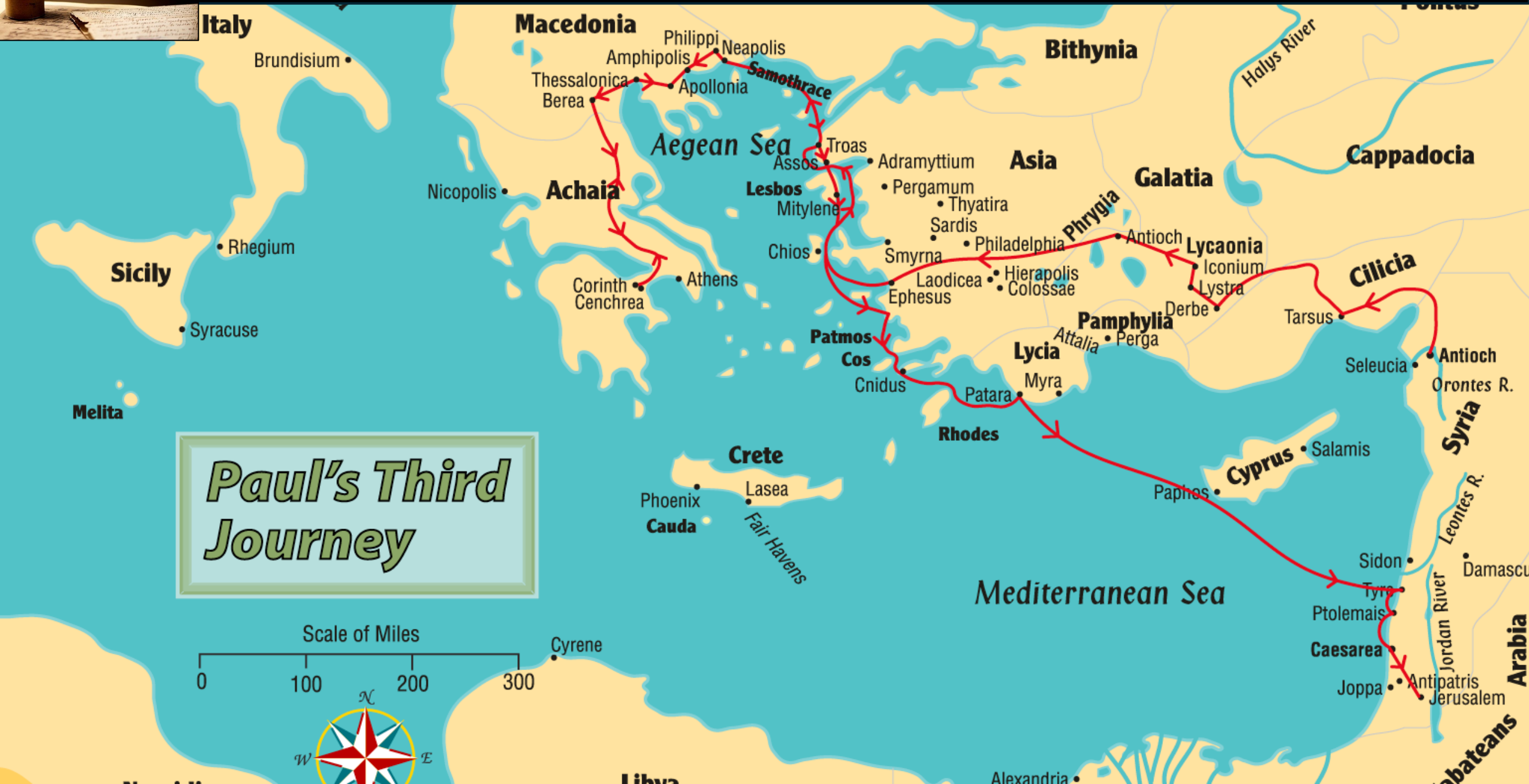
Paul's Third Journey